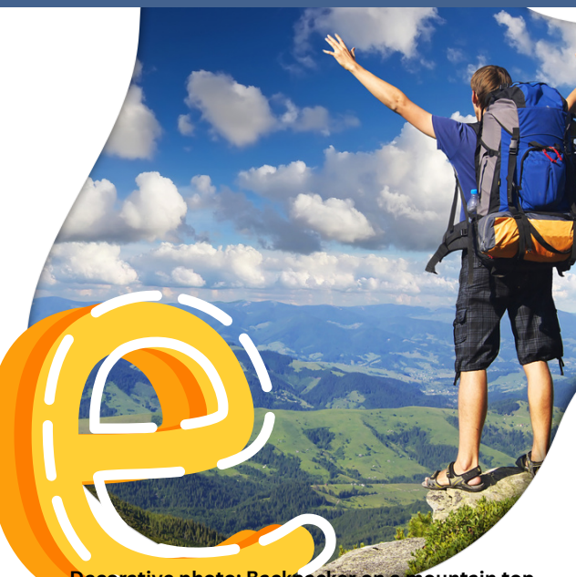
Decorative photo: Backpacker on a mountain top looking over a mountainous view.

While there is a need to support the restarting of the tourism and culture sectors, after the COVID-19 pandemic, adapting the activities to manage the ongoing transition to a more digitalised, greener and more resilient society, add a new challenge. Thus, lack of digitalization across the touristic and culture sectors, alongside with the need for digital education and trainings to improve the overall level of digital skills and add a new layer competences, of risks and consequences, as the use of modern digital technologies is a necessity for an integrated management of these sectors.